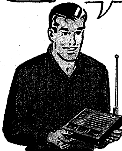
Mark Trail image courtesy of North America Syndicate, Inc., World Rights Reserved

GET THE INFORMATION YOU NEED...24 HOURS A DAY...GET A NOAA WEATHER RADIO!